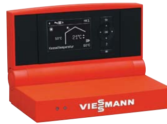
Vitotronic 200 control unit with clear menu navigation

System owners and heating contractors alike benefit the easy-to-use, flexible Vitotronic 200 KW6B controls that manage the entire heating system with maximum comfort, precise temperature settings and cost-effective fuel savings. The control menu is logical, intuitive and easy to set up. Features include intelligent DHW control, a variable speed pump output (0-10 V), multiple setback timers, and the ability to control up to 3 heating circuits.