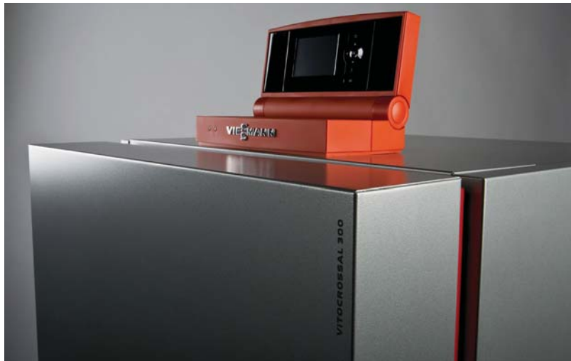
Vitocrossal 300, CU3A gas condensing boiler is ideal for residential and light commercial applications.

The power of a simple solution. With best-in-class, Viessmann-made components, the Vitocrossal 300, CU3A is the perfect choice for residential and light commercial applications.